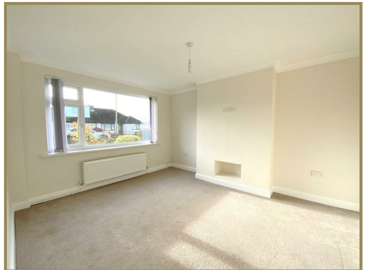
13, Priors Close, New Waltham, DN36 4QZ £160,000